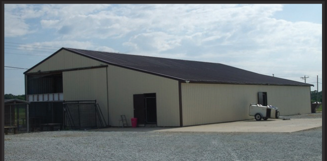
Another kennel located on the property.