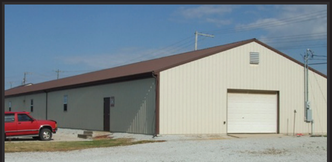
One of several buildings used for training at VLK.