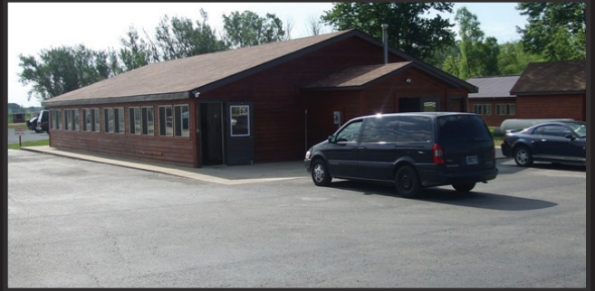
One of several kennels onsite.

VLK has a large training facility that enables them to offer an unprecedented learning environment. From their equipment store to the student dorm facilities, K-9 "Hogan's Alley," multiple full-scale complex buildings, schools, and warehouses, to 400+ acres of property, no operational or training objective is too small or too large. VLK's kennel facility has a full obstacle course, an office building that contains an administrative area, store, trainer's offices, two training classrooms,