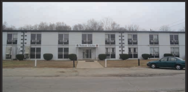
Full-service hotel for students owned by VLK.